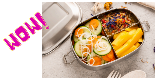
Bento style Lunch box

As described on the Government of Canada website, every February, Canadians celebrate the many achievements and contributions of Black Canadians and their communities who, throughout history, have done so much to make Canada a culturally diverse, compassionate and prosperous country. This month students will be learning about various Black Heros who have brought positive change in our world.